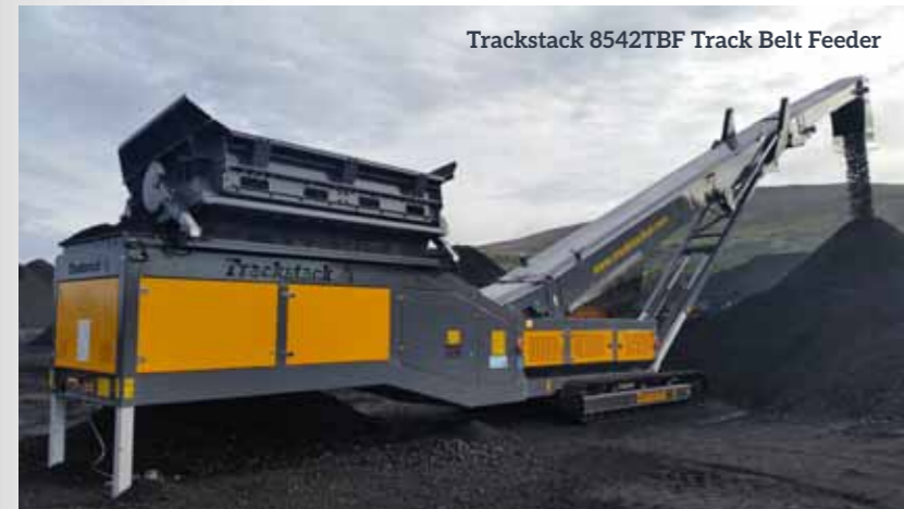
Trackstack 8542TBF Track Belt Feeder