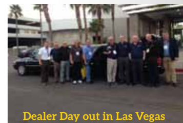
Dealer Day out in Las Vegas

The tri-annual trade show in Las Vegas was the focal point for the launch of the 1200TC tracked cone crusher in the North American market. Overall there was huge turnout at the show and proved to be a huge success.