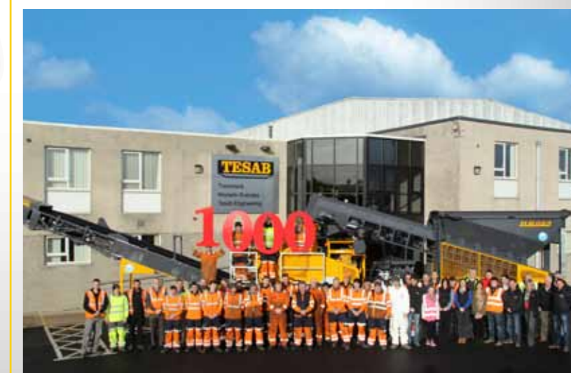
Tesab Staff with the 1000th 623S impact Crusher

Also, there has been recent development with new lines of bulk handling equipment manufactured under the Trackstack Range.