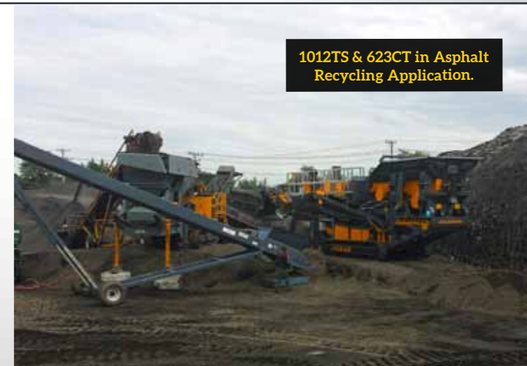
1012TS & 623CT in Asphalt Recycling Application.

The unique design of the Tesab crushing unit, achieves a much higher percentage of material passing specification in a single pass of the crusher. The performance of the 623CT in this application is equivalent to that of much larger type crushers from other manufacturers.