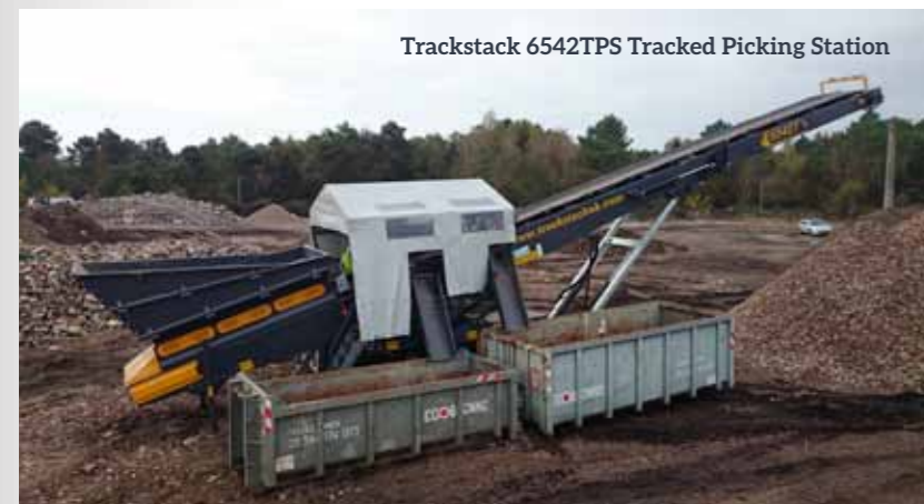
Trackstack 6542TPS Tracked Picking Station