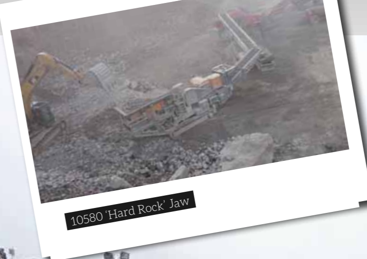
10580 'Hard Rock' Jaw

"Heavy duty and robust design for mining & quarry applications"