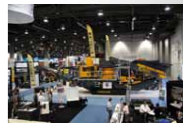
Con-Expo / Con-Agg 2014

Tesab rebranded in 2014 and the new look now incorporates our core principles of heavy duty equipment that is built to last.