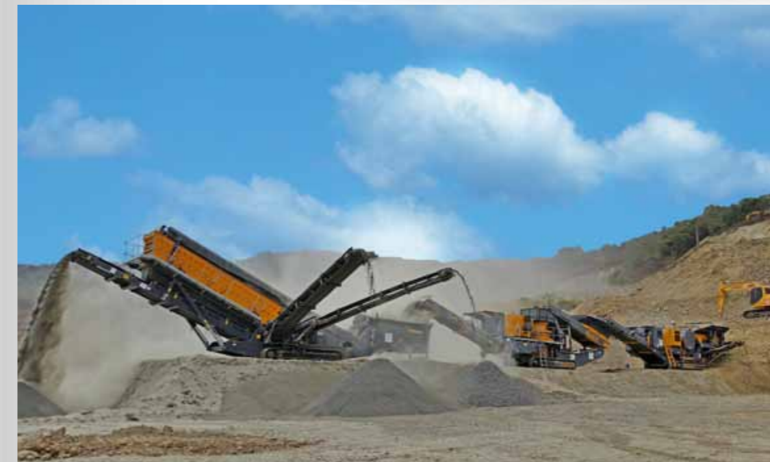
Tesab Crushing and Screening Train in South America. 10570, 1200TC and TS3600 Producing Aggregates